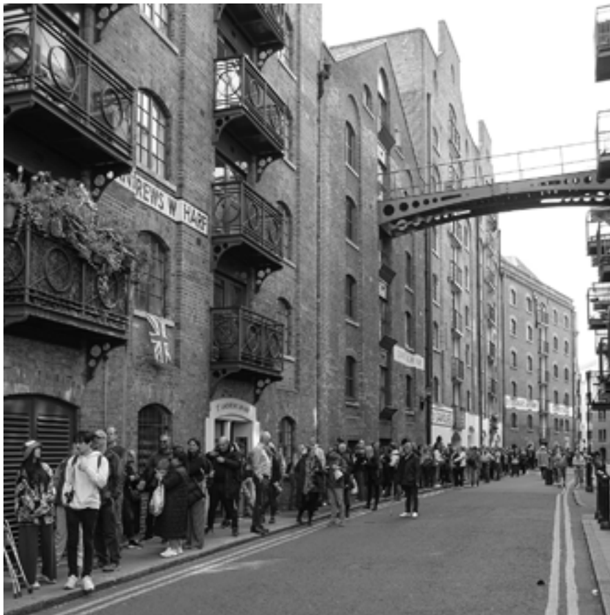
The Queue (Ed Braidwood)