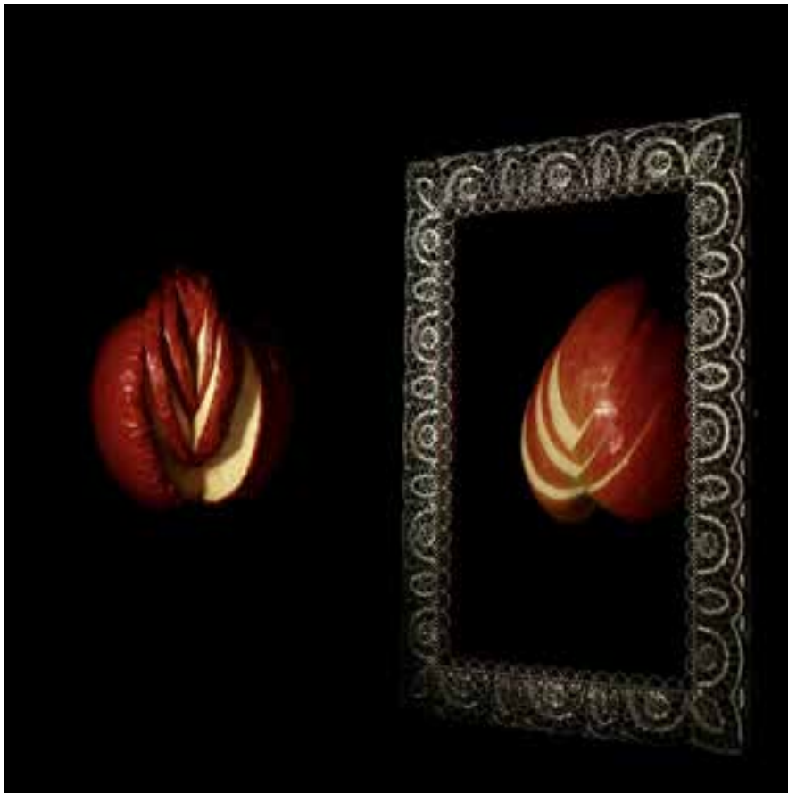
Subject 2 (Nanette Parker)