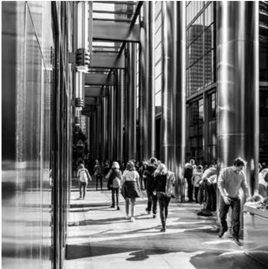
Weekend Crowds (Ed Braidwood)