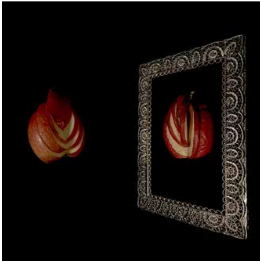
Subject 1 (Nanette Parker)