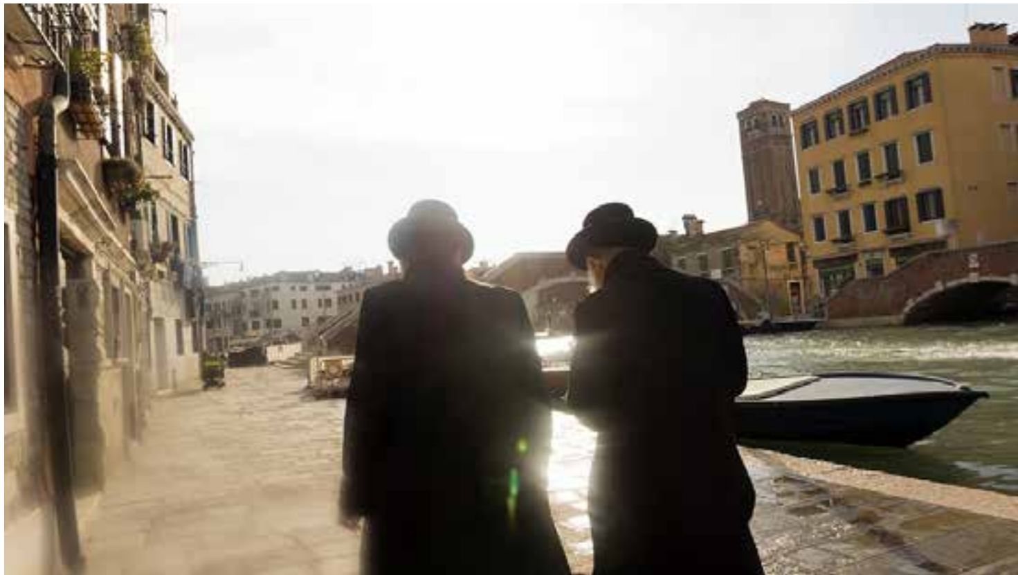
Walking around Venice