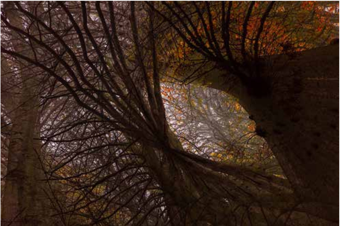
You can't break bundled branches 1 (Ann Backx)