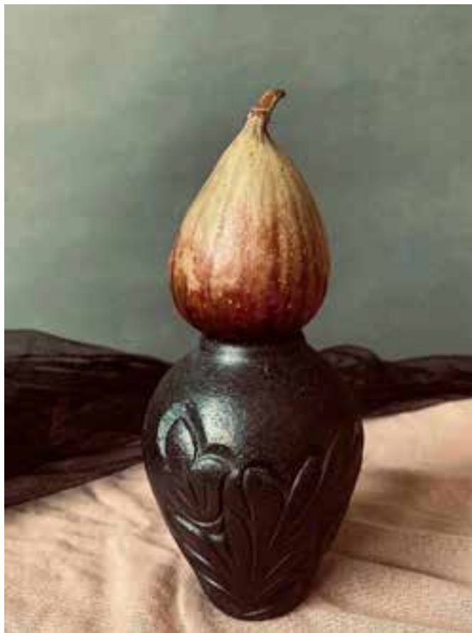
Still life with vase and fig (Ioana Cobzaru) 2020 • 30x40cm • Digital Photography