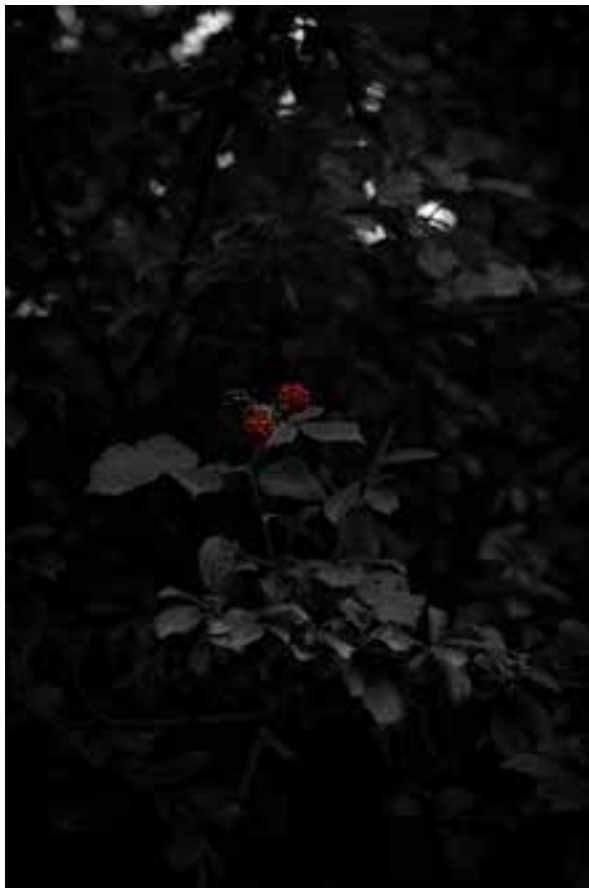
Subject 2 (Martina Lana)